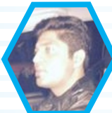
Dr. Maverick ADC (Australia) Prelims & Clinical 2015